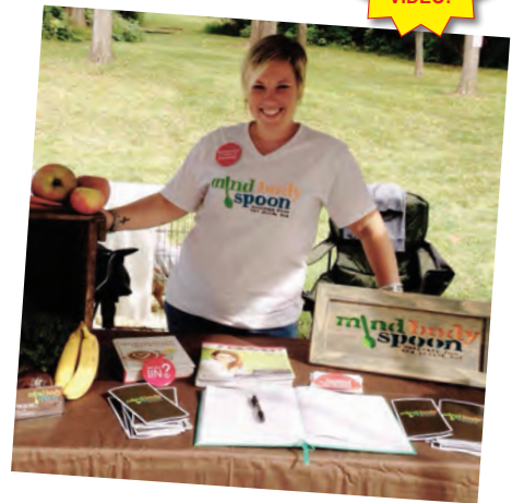
Matcha Powder with Ice Water; this will set you back about $4.

Excited to try matcha? Local health food stores as well as online are great sources for picking you stash of wellness awesomeness, anywhere from $20-$30. My personal favorite is Epic Matcha, out of Arizona. www.epicmatcha.com has a wealth of information as well as a store to get your goodness. Not looking to purchase just yet and would rather try it first? Head on over to your local Starbucks and order Shaken