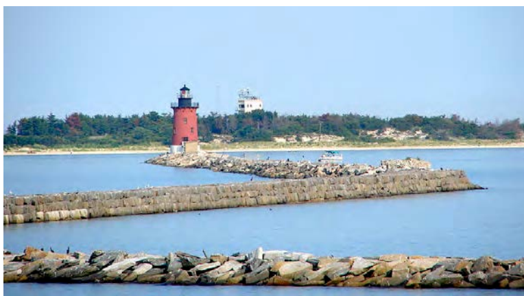
DE Breakwater East End Light, Wikimedia, public domain

long, built in two intersecting legs to form a large harbor. Included were a series of 10 hexagonal ice breaker piers, placed 200 feet apart, extending out from the breakwater. Steam powered equipment allowed for the precise placement of stone boulders, each weighing about 13 tons. Stones were cut square and fit in even courses with a straight edge on top. The barrier is about 8000 feet long, extends to a depth of about 50 feet, with 40 ft. width across the top. The cost was just over $2,000,000.