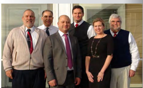
(pictured left to right)

Cardiovascular Consultants of Southern Delaware