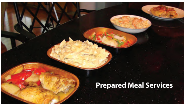
Prepared Meal Services

With The Elegant Plate, The Hottest Restaurant in Town