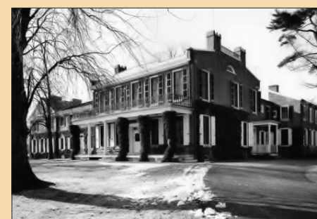
Photo of Buena Vista