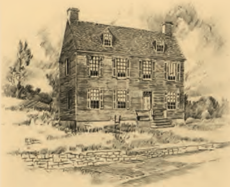
BIRTHPLACE OF JOHN M. CLAYTON.

One of Delaware's most prominent statesmen was born in Dagsboro, Delaware on July 24, 1796 in a house that once stood on the corner of Main and Clayton Streets, just across from the present town