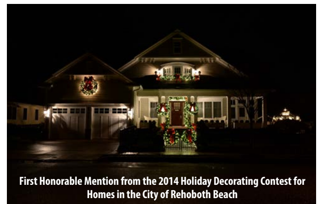
First Honorable Mention from the 2014 Holiday Decorating Contest for Homes in the City of Rehoboth Beach

Rehoboth Beach – The holiday season is rapidly approaching, and the Rehoboth Beach Homeowner's Association and Rehoboth Beach Main Street (RBMS) invite homes in the city of Rehoboth Beach to "deck the halls" and make the holiday season a little more special and festive downtown. There will be two categories – Traditional and Truly Fabulous. A secret panel will be judging the contest December 18 & 19 from 5:30 to 10:30 pm. The top three winners will receive: (1st Place) $250 in RBMS Gift Certificates, (2nd Place) $100 in RBMS Gift Certificates, (3rd Place) $50 in RBMS Gift Certificates. Winners will be announced on Monday, December 21. All winners and honorable mentions will receive a 2016 Friend of Rehoboth Beach Main Street membership! Registration is not required, however, you may email us at info@rbhomeowners.com to let us know you are participating.