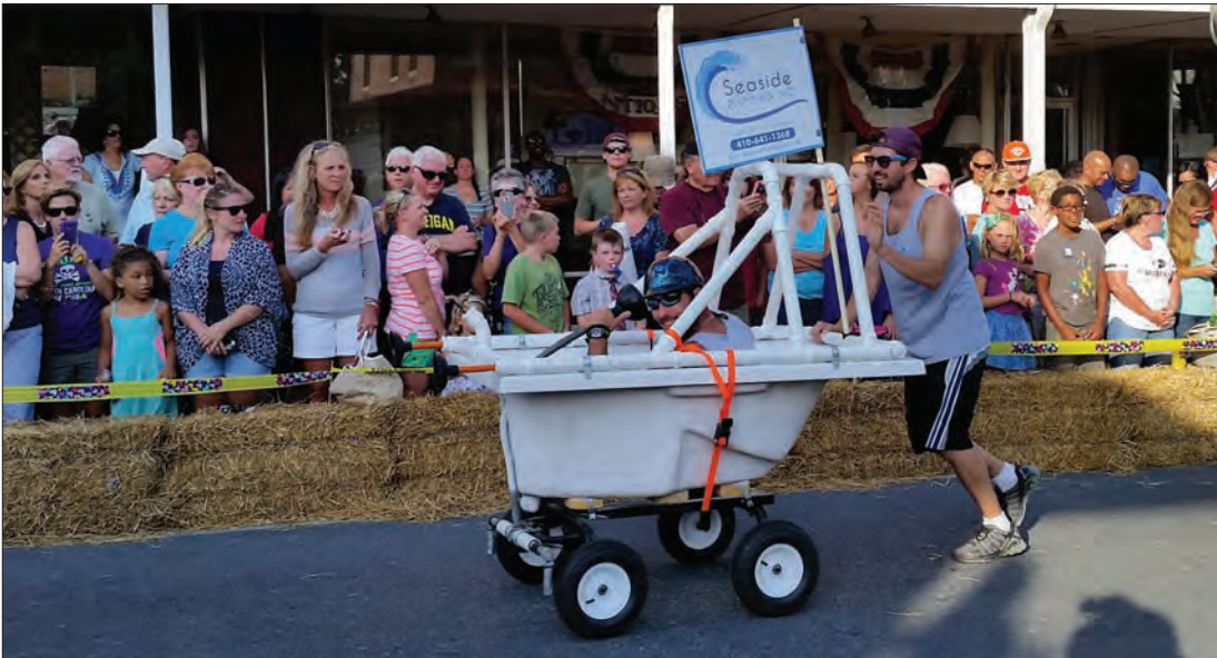
When the work is done there is always time to laugh with the staff at Seaside Plumbing Inc. They had lots of “good clean fun” in the 2016 Berlin MD bathtub races!

For More Information: www.seasideplumbinginc.com 410-641-1368