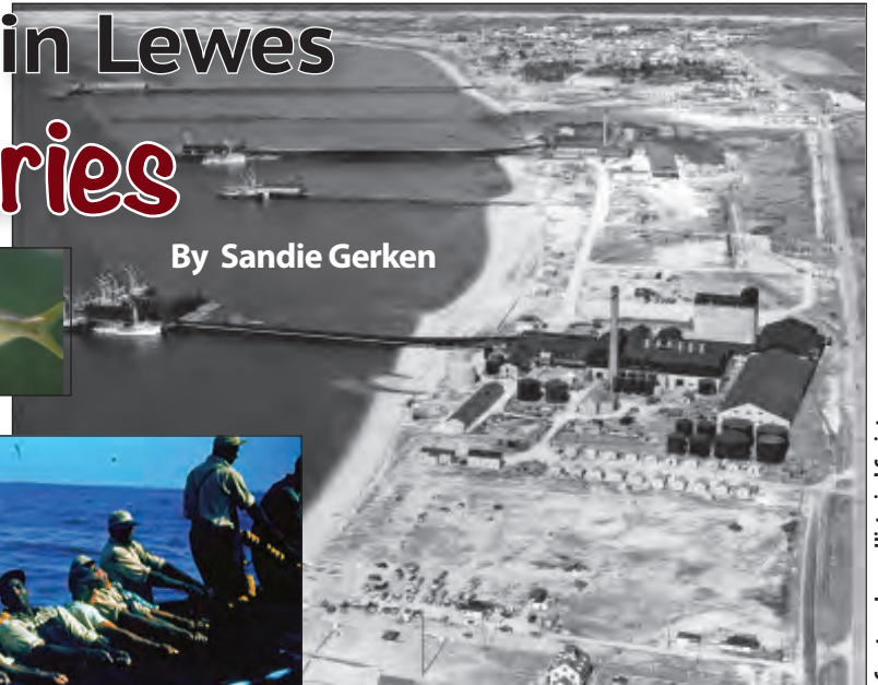
Clockwise: Fish: Atlantic Menhaden; View of the fisheries in Lewes at the height of Menhaden fishing; and a vintage postcard of Menhaden Fishermen in boat.