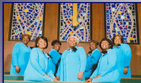
Come hear these anointed women of God!

THE VICTORIAN Gospel Singers of Baltimore have graced the stage with such gospel greats as Vicki Winans, The Jackson Southernaires, Richard Smallwood, The Mighty Clouds of Joy, The Clark Sisters and others.