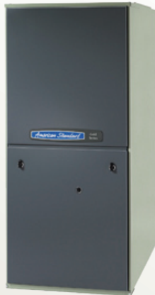
Gold ZM Freedom® 95 Comfort-R™ Variable-Speed

High quality and high efficiency mean a high standard of comfort for your home. The Gold Series offers just that. Whether you choose variable-speed technology, or a single-stage offering with the power to increase your overall system efficiency, you can be sure that each one contains American Standard's quality craftsmanship.