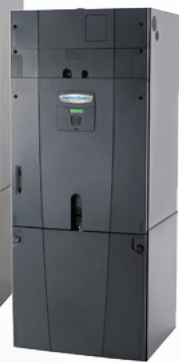
Platinum XV TAM7