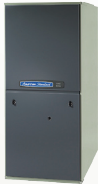
Gold XI High Efficiency Single-Stage