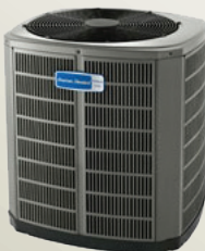
Platinum XM Heritage® 16