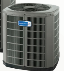
Gold XI High Efficiency Single-Stage