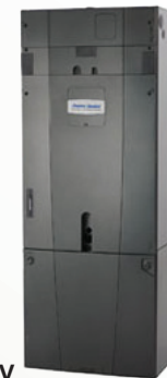
Platinum ZV TAM8

Our most innovative offering is also our most efficient. Featuring a variable-speed motor and integrated humidity control through Comfort-R™ technology, many models in our Platinum Series also include advanced communication features for a perfectly optimized matched system.