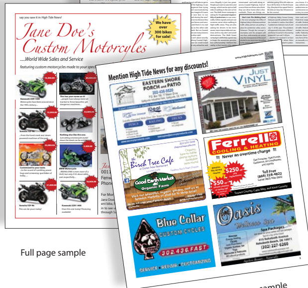
Full page sample