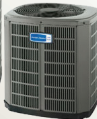
Gold SI Heritage® 13