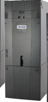
Gold XI GAM5