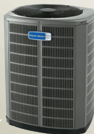
Platinum ZM Heritage® 20

Our most efficient and powerful heat pumps. Enjoy the highest level of comfort and maximum efficiency with features like dual or multi-stage Duration™ compressors and Spine Fin™ coils.