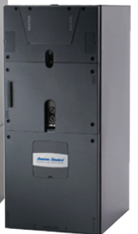
Gold SI GAF/T2