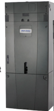
Gold XM TAM4

The Gold Series isn't just comfortable and efficient, it's quiet too. With its high-efficiency motor and precision craftsmanship, this series gives you the comfort and reliability you and your family deserve.