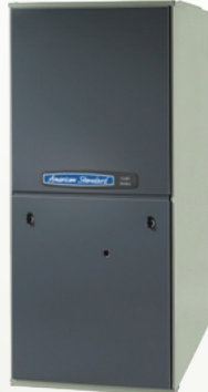
Gold XM High Efficiency Two-Stage