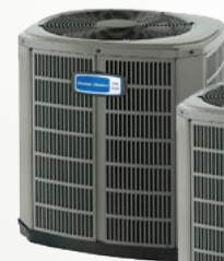
Gold XI High Efficiency Single-Stage

Gold Series air conditioners feature proprietary Spine Fin™ Coils and Duration™ compressors, and efficiency that keeps you energy smart and comfortable in even the hottest weather.