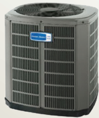
Gold XI Heritage® 15

Efficient in any weather, Gold Series heat pumps keep the comfort coming with durable, hardworking components and finely-tuned craftsmanship.