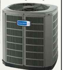
Gold XI High Efficiency Single-Stage